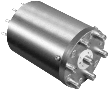
461 Latching Terminated Series, SMA