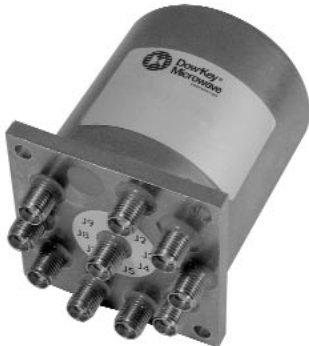
591 Normally Open, SMA